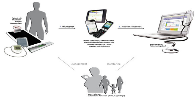
Fig 3: Health monitoring ( http://www.embs.org/ )

Examples of treatment by a wearable are insulin pump therapy for diabetics and a brain implant to facilitate communication with speech-incapable patients.