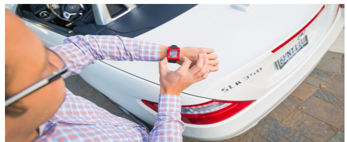
Fig 1: Mercedes-Benz pebble smart watch ( http://www.digitalspy.co.uk/ )

Another example is the Mercedes-Benz pebble smart watch (Fig 1). The idea is that drivers use the sleekly styled smart watch to check on their vehicle's location, door lock status and even fuel level. The nifty watch can alert its wearer of incoming calls, texts and emails, so too can it in theory warn the driver of real-time hazards when behind the wheel.