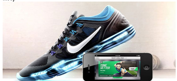
Fig 4: Nike Smart Training Shoes ( https://www.google.co.in/ )

Also an activity tracker is a device or application for monitoring and tracking fitness-related metrics such as distance walked or run, calorie consumption, and in some cases heartbeat and quality of sleep